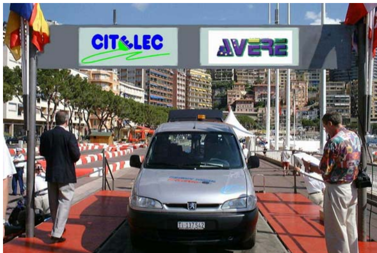
The departure of the second TRANSEUROPEAN ® on the quayside at Monaco

The third edition in 2001 linked Monaco to the EVS-18 symposium in Berlin. The results of this event will be documented on the dialogue presentation on EVS-18.