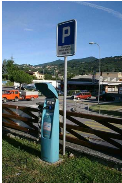
A “Park & Charge” station at Mendrisio, Switzerland

Examples of infrastructure were encountered en-route, such as the “Park&Charge” posts established in Switzerland, whose network has enabled inter-regional use of electric vehicles in that country.